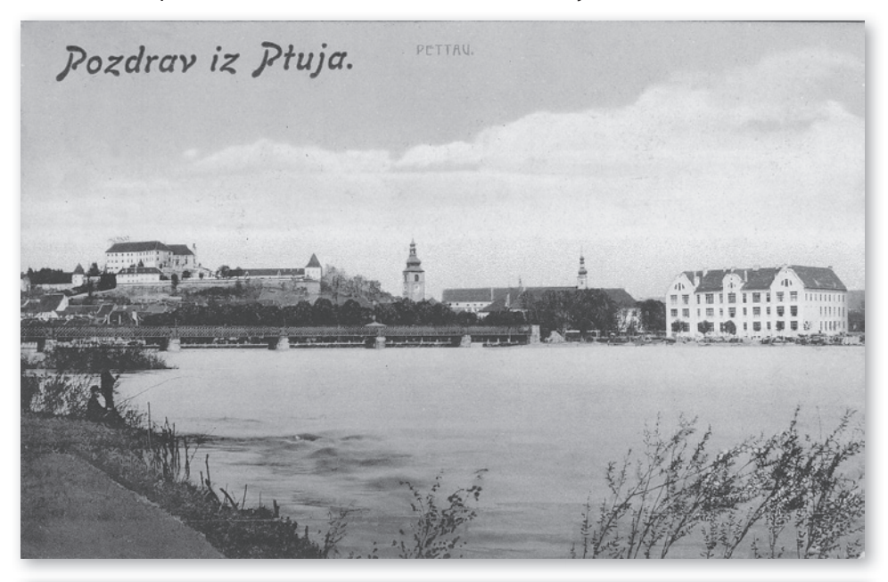
Figure 8 and 9: Pettau. Pozdrav iz Ptuja . [stamped over after 1918] producer Wilhelm Blanke, Pettau , produced before 1918, sent in 1919 from Ptuj/Pettau to Silesia.