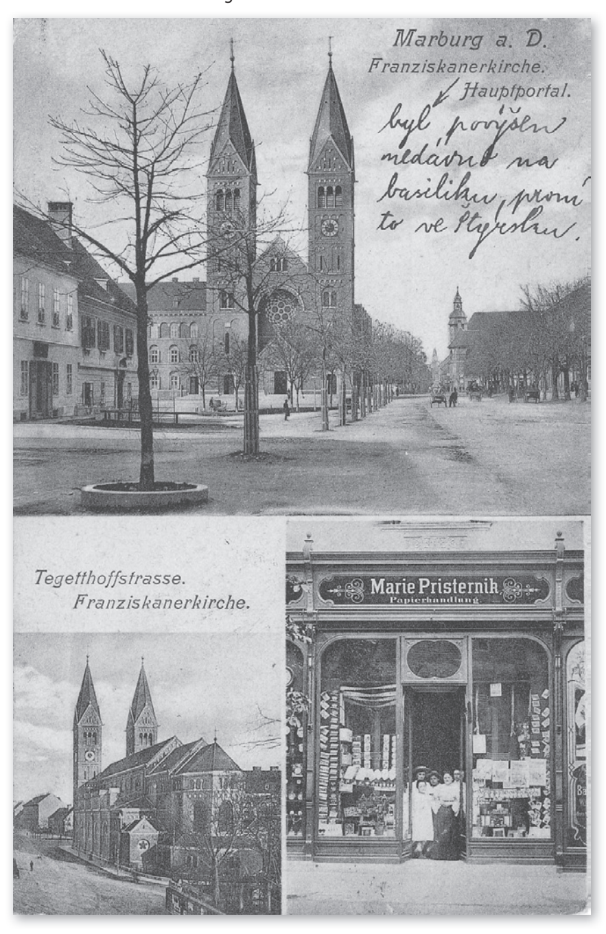
Figure 1: A picture postcard from Maribor/Marburg. In the lower right, Marie Pristernik's stationery shop with postcards in the shop windows. Marburg a. D. Franziskanerkirche . Hauptportal. Tegetthoffstrasse. Franziskanerkirche , produced most likely by Marie Pristernik, sent in 1904 from Maribor/Marburg to Carniola.