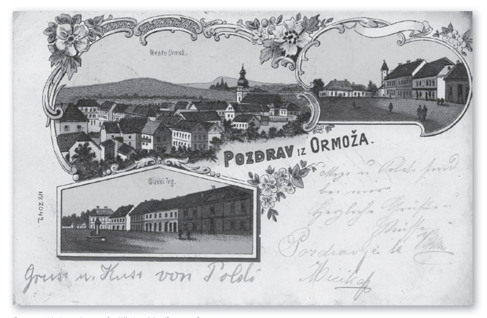
Figure 7: Pozdrav iz Ormoža. Mesto Ormož. Glavni trg. , producer unknown, sent in 1904 from Ormož/Friedau to Morava.