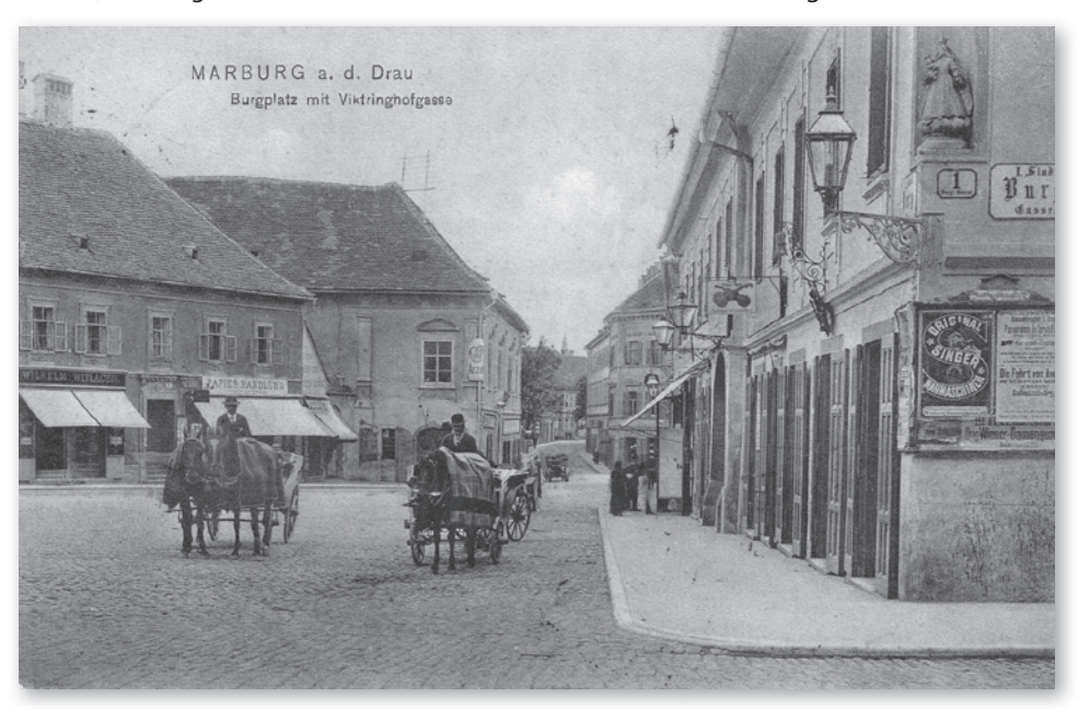
Figure 3 and 4: Marburg a. d. Drau. Burgplatz mit Viktringhofgasse , produced by Rudolf Gaisser, Marburg , sent between 1808 and 1914 from Maribor/Marburg to Vienna.