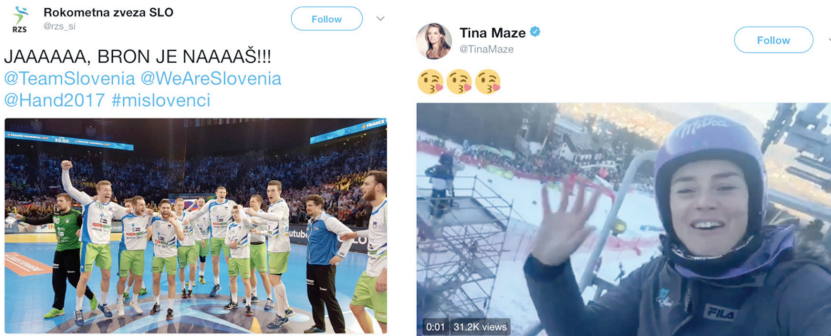
Table 5: Use of hashtags, emoji, hyperlinks and mentions by corporate and private users in the Janes-Tweet corpus.

Figures 3 and 4: The most liked (left) and the most retweeted (right) tweet posted by corporate users in the Janes-Tweet corpus.