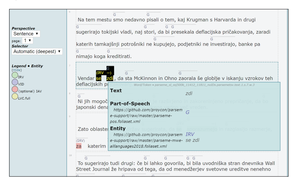
Figure 2: Annotations in FLAT